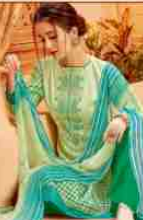
*** S.498-007 ***