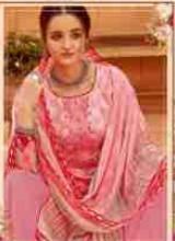
*** S.498-008 ***