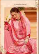
*** S.498-004 ***