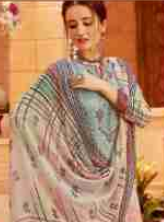
*** S.498-002 ***