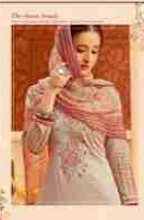
*** S.498-005 ***