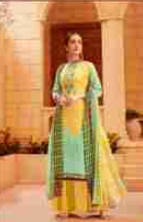
*** S.498-003 ***