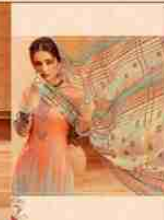
*** S.498-006 ***