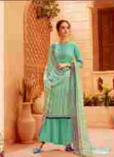
*** S.498-001 ***