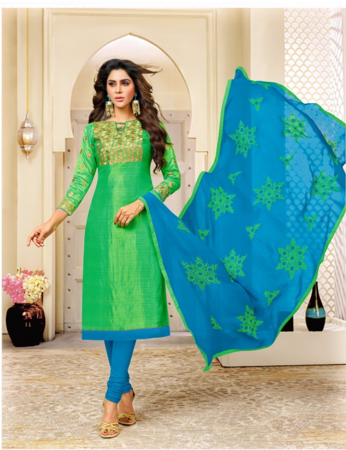
"Luxury is the ease of a t-shirt in a very expensive dress 907