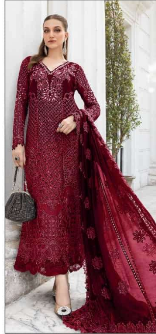
S - 612 C