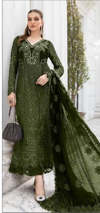
S - 612 B