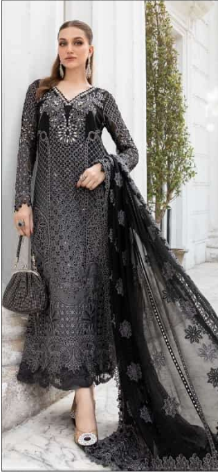
S - 612 A