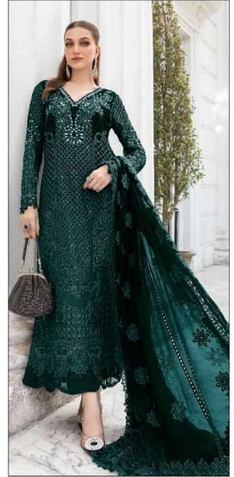
S - 612 D