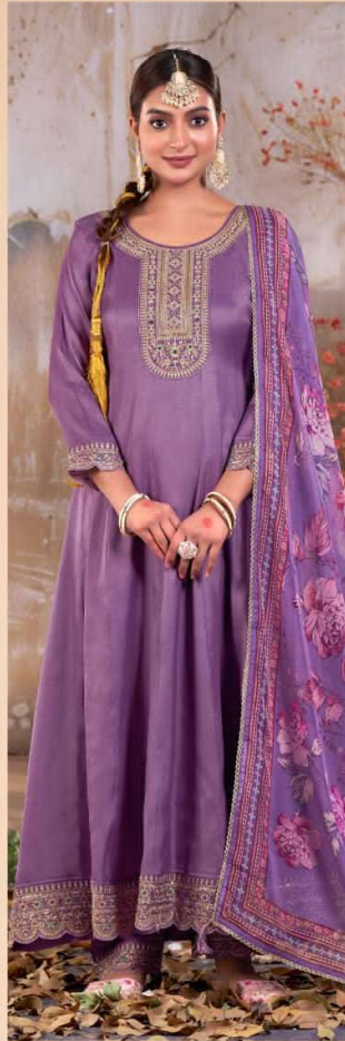
CODE | 5832