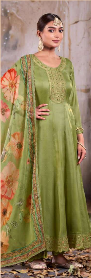
CODE | 5831