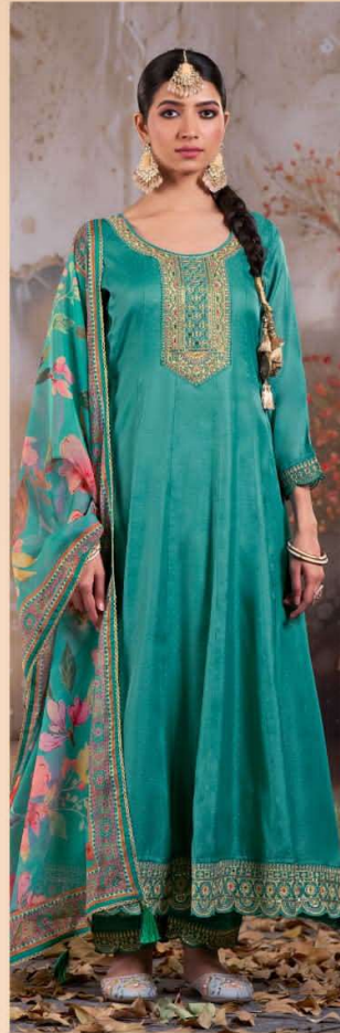
CODE | 5833