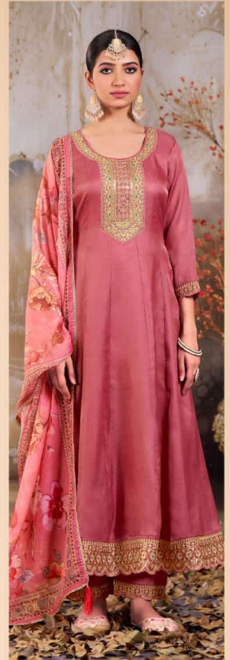
CODE | 5834