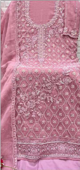
S - 391 A

DUPATTA - CURRENCY HEAVY EMBROIDERY WORK