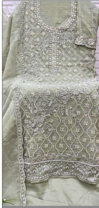
S - 391 B