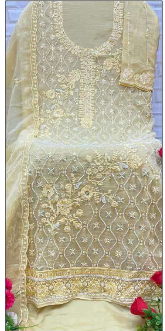
S - 391 D