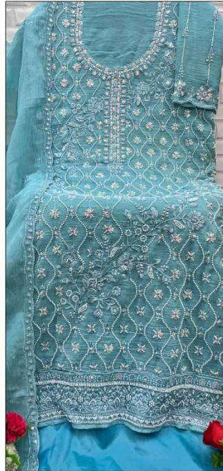
S - 391 C