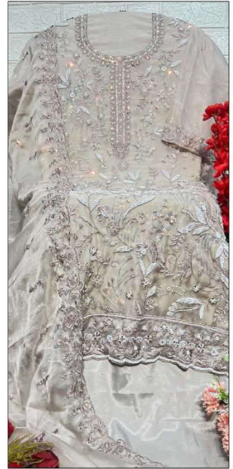
S - 378 D