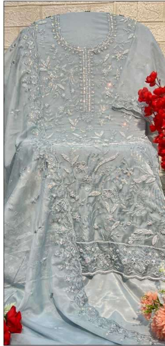
S - 378 B