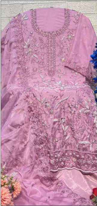
S - 378 A

Dupatta - soft tabby organza heavy embroidery work