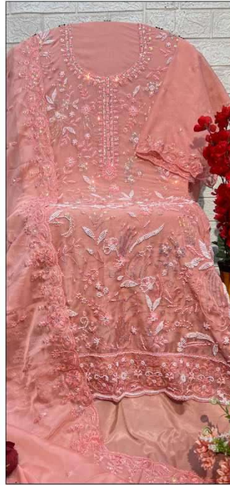
S - 378 C