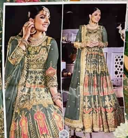
CHANTELLE Vol-7 ZAHA D.No. 10347 TOP: Butterfly net with... BOTTOM: INNER... TRIPATTA: Full length... and accessories...