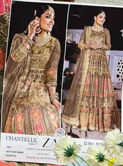
CHANTELE Vol-7 ZAHNA D.Nr 103 TOP Butterfly net with Embroidery BOTTOM INNER Full Satin DUPATTA Butterfly net with Embroidery