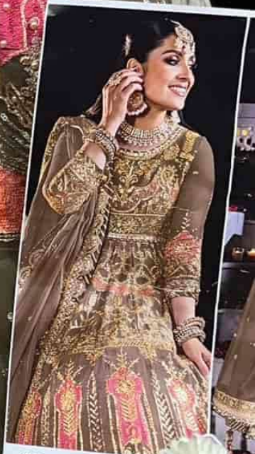
CHANTELLE Vol-7 TOP Butterfly net with Embroidery BOTTOM-INNER Dull Santoni DUPATTA Butterfly net with Embroidery