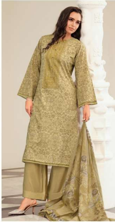
AN / 01