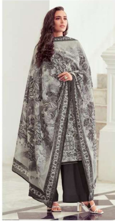
AN / 02