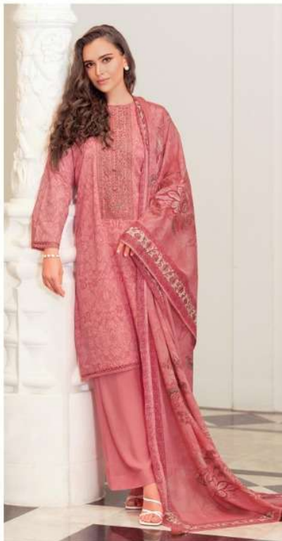
AN / 03