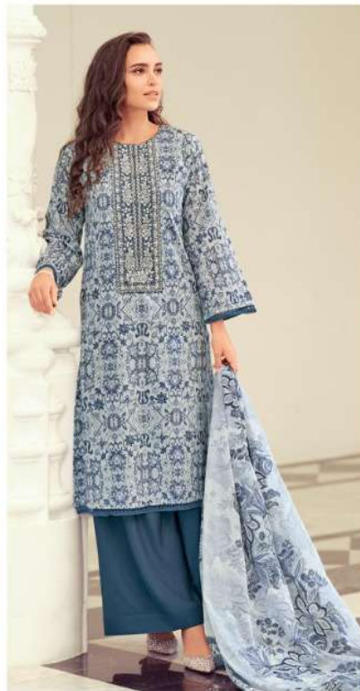
AN / 04