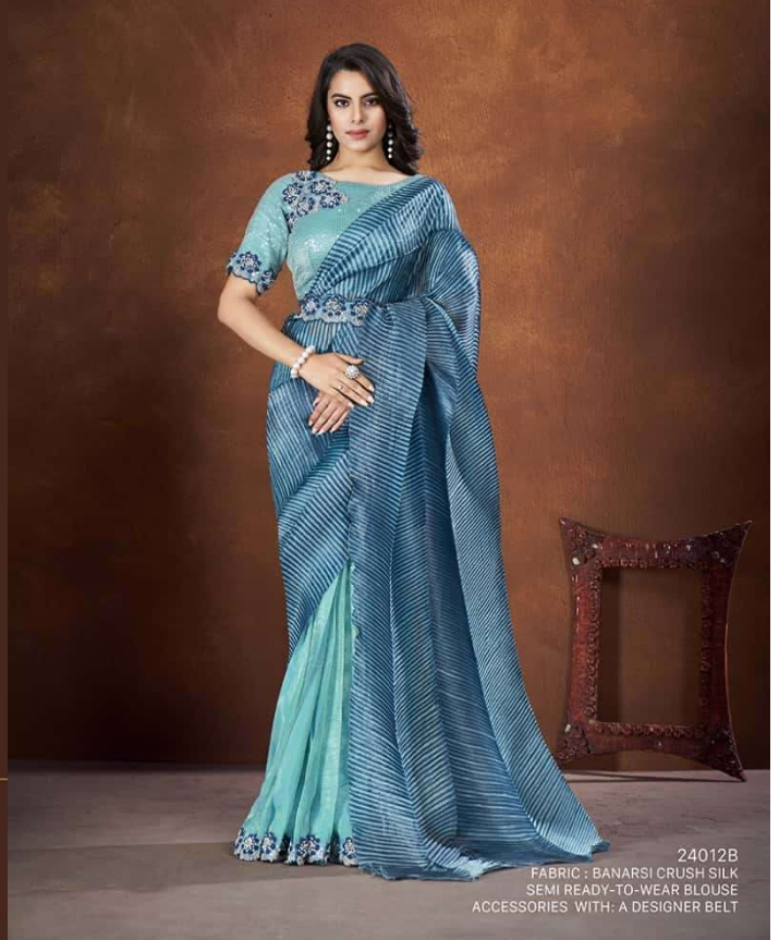
24012B FABRIC : BANARSI CRUSH SILK SEMI READY-TO-WEAR BLOUSE ACCESSORIES WITH: A DESIGNER BELT