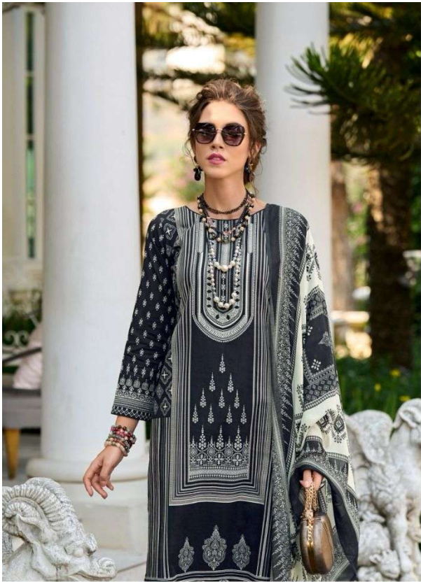
SHE CAN BEAT ME, BUT SHE CANNOT BEAT MY OUTFIT