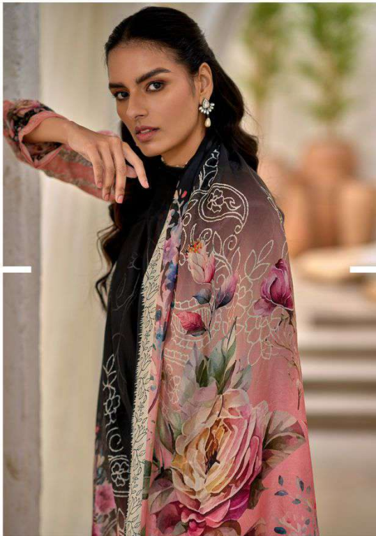
OUTFITS THAT WILL MAKE YOU COMFORTABLY BEAUTIFUL