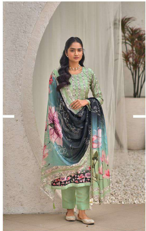
10496 KEEP CALM & SURROUND YOURSELF WITH FASHION