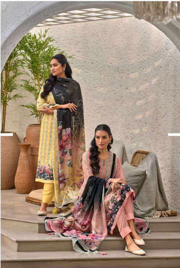
OUTFITS THAT WILL MAKE YOU COMFORTABLY BEAUTIFUL