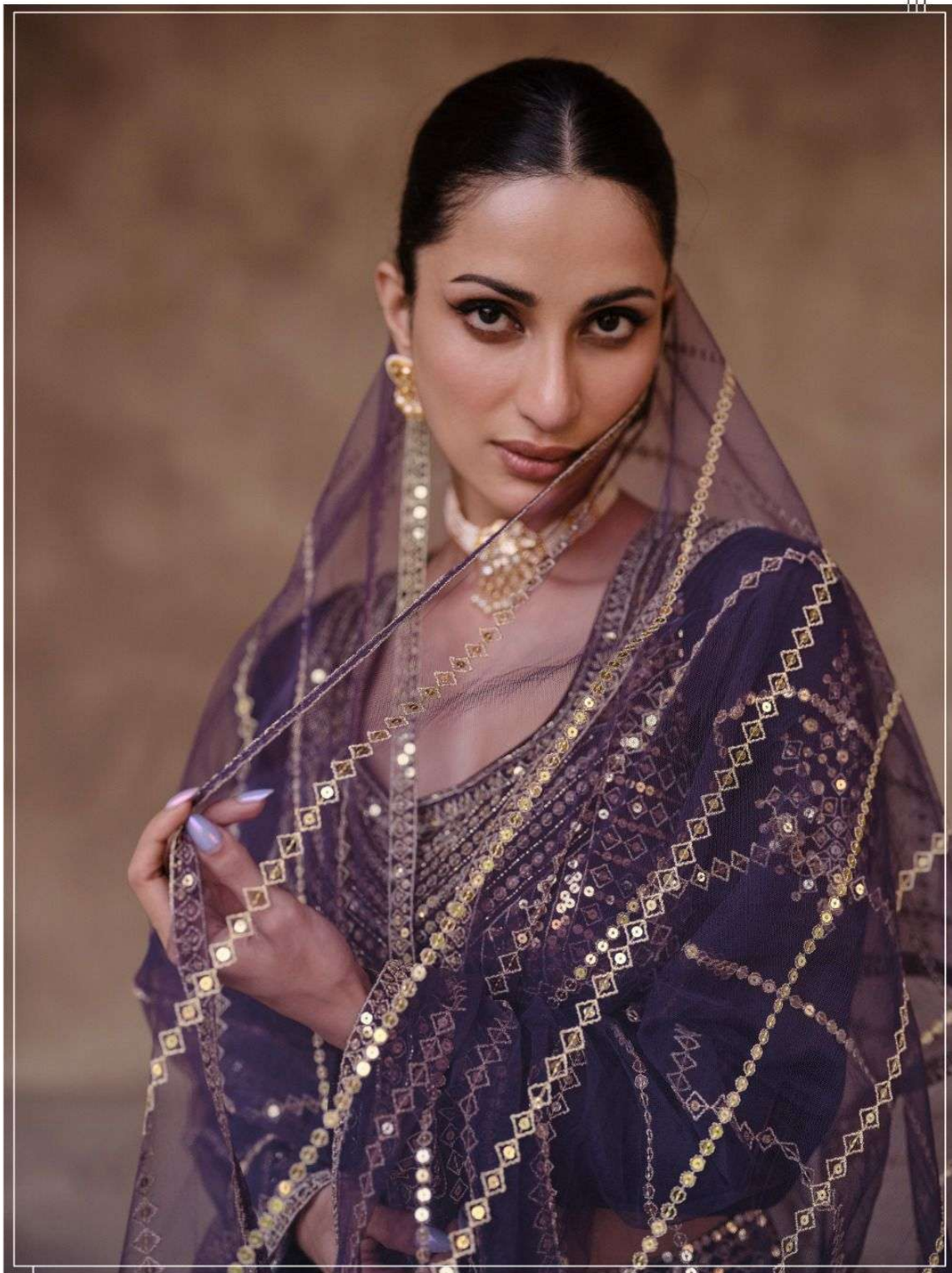
A breath taking array of fine detailing & intricate design inspired by Indian culture ..... CODE - 5394