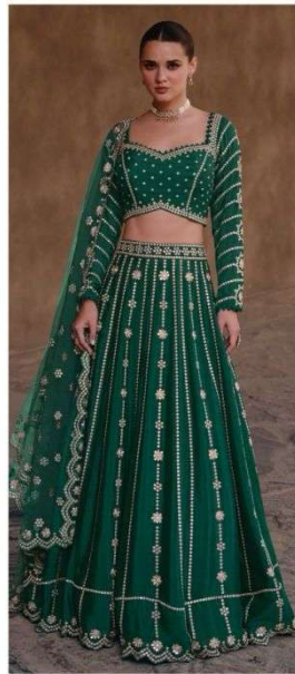
CODE - 5396