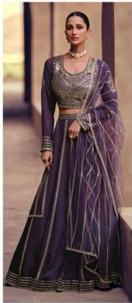
CODE - 5394