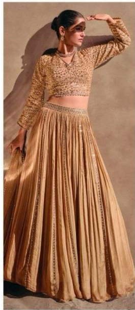
CODE - 5395