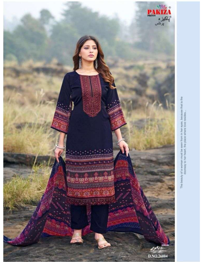
Royal Romance A WOMAN TALE OF ROMENCE IN EACH ENSEMBLE