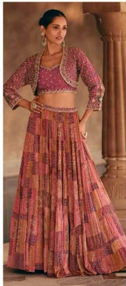
CODE - 5392