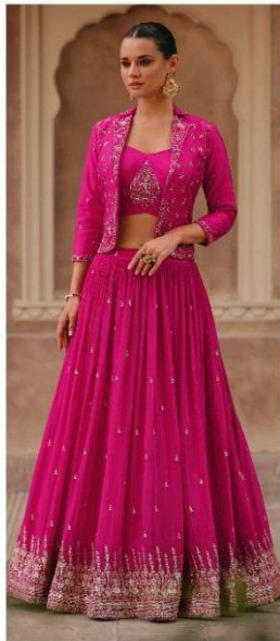
CODE - 5391