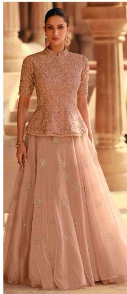
CODE - 5393