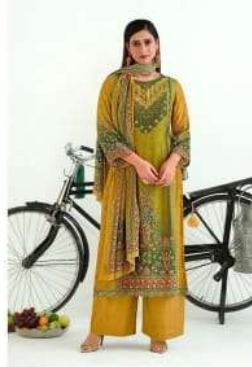
ELEN | 2820