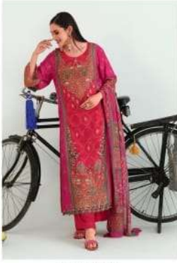
ELEN | 2817