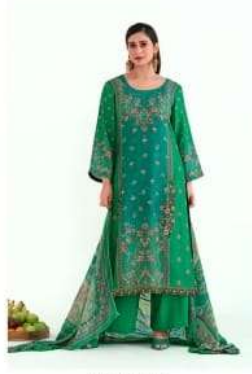
ELEN | 2818