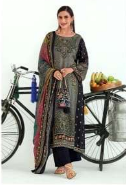
ELEN | 2819