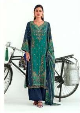
ELEN | 2822