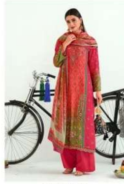
ELEN | 2821