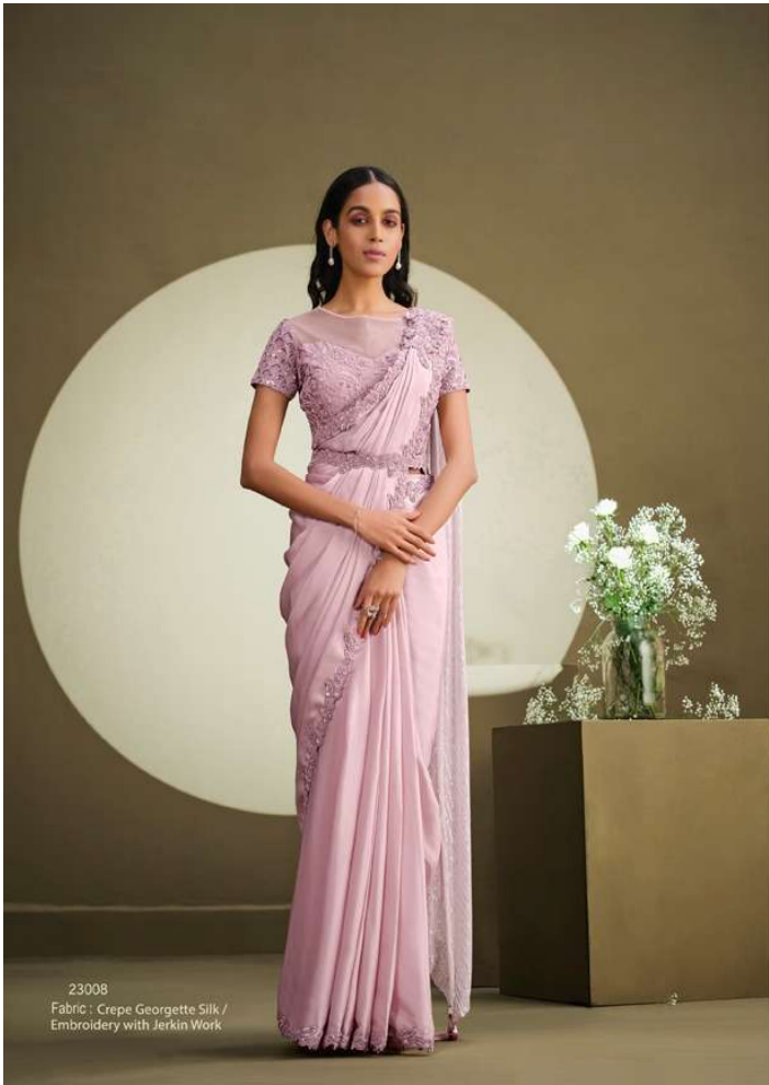
23008 Fabric : Crepe Georgette Silk / Embroidery with Jerkin Work