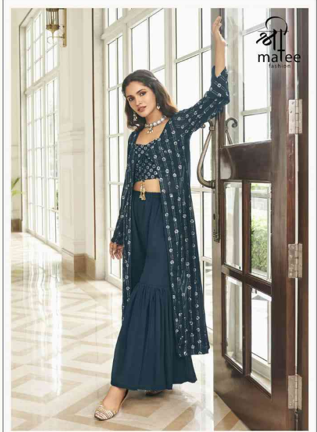
My fashion is about the urban woman in the year. I think about obscure, weird things and try to create a world around them CODE 134