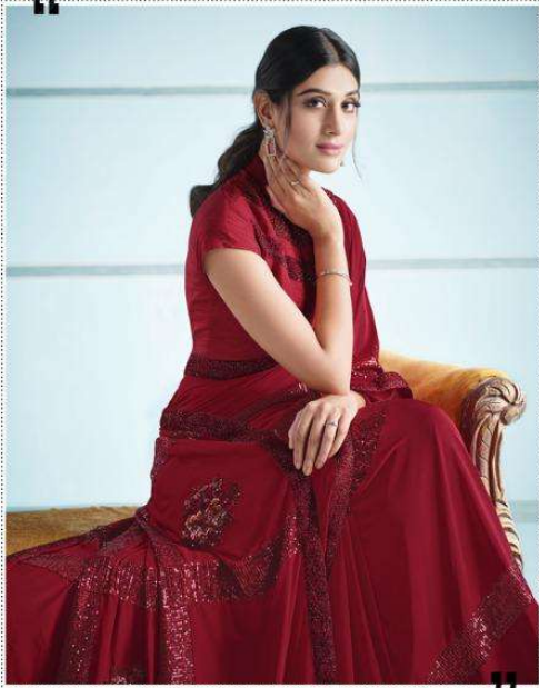
A Queenly shade of Red with a never-like-before checkered sequin placement with applied florals.