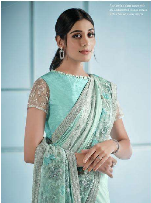
A charming aqua saree with 30 embroidered foliage details with a hint of silvery sheen.