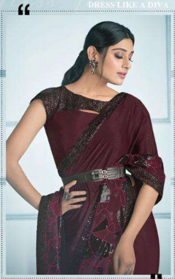
Deep shade of wine adorned with hints of abstract black sequins for a diva-esque appeal