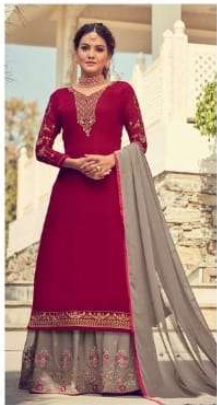
CODE \ 7304