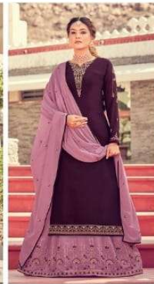
CODE \ 7306