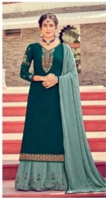
CODE \ 7301