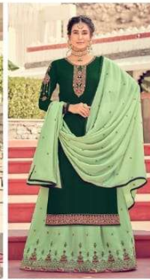
CODE \ 7303