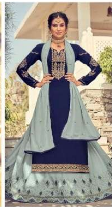
CODE \ 7305