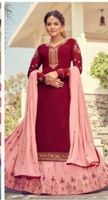
CODE \ 7302