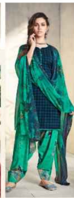
D // 3002