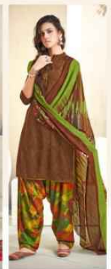
D // 3008