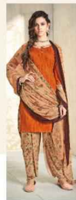
D // 3005