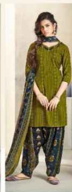
D // 3006