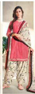
D // 3003