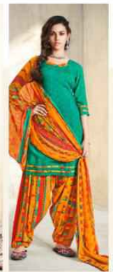
D // 3004