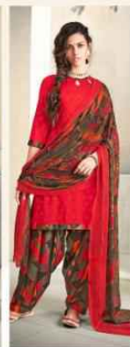
D // 3007