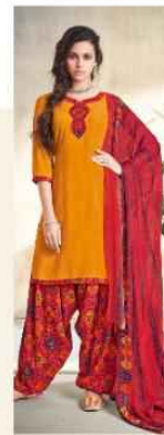
D // 3001