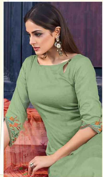
The world of Beautiful Bridals...