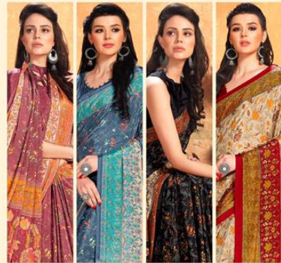
8209 A 8209 B 8210 A 8210 B