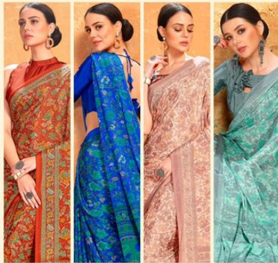
8207 A 8207 B 8208 A 8208 B