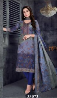
33073 GARMENTS CODE.