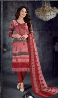
3306 GARMENTS CODE.