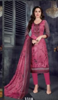
3310 GARMENTS CODE.