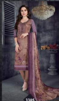
3305 GARMENTS CODE.