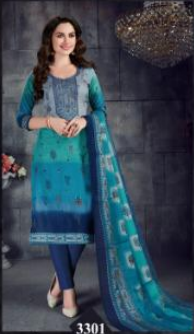
3301 GARMENTS CODE.