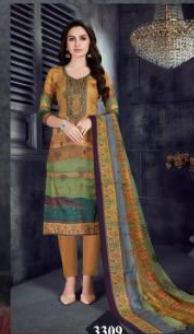
3309 GARMENTS CODE.