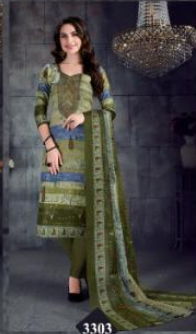
3303 GARMENTS CODE.