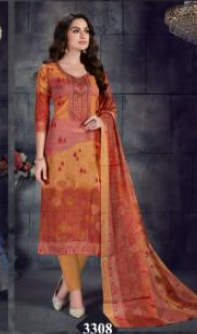
3308 GARMENTS CODE.