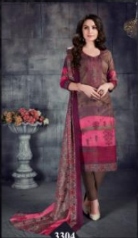
3304 GARMENTS CODE.