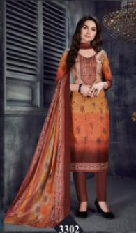
3302 GARMENTS CODE.