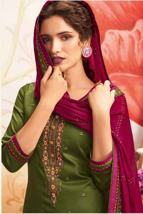
TRADITIONAL GLAMOUR 113