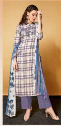
STYLE # 139-004