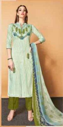
STYLE # 139-001