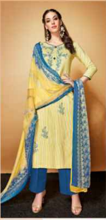
STYLE # 139-003