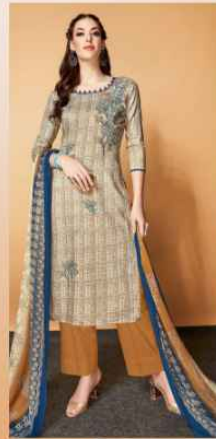
STYLE # 139-008