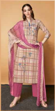
STYLE # 139-006