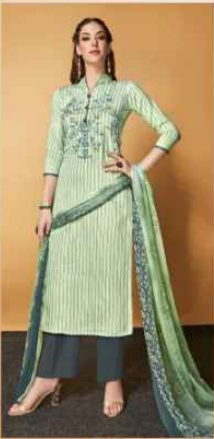
STYLE # 139-007