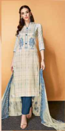
STYLE # 139-005