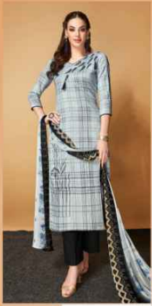
STYLE # 139-002