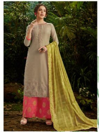
CODE # 24008