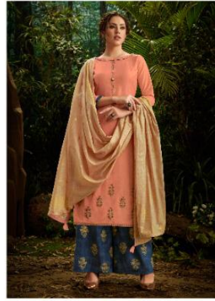
CODE # 24003