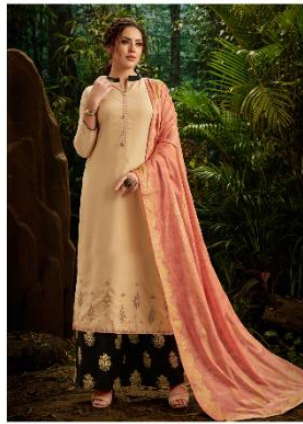
CODE # 24006