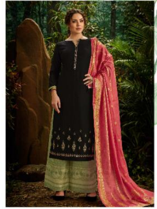
CODE # 24004