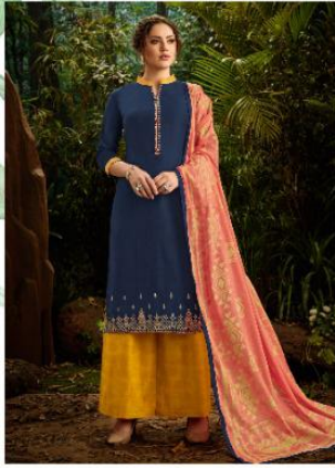
CODE # 24001