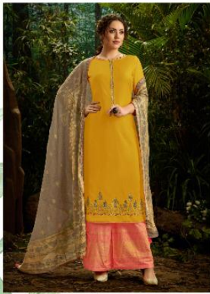
CODE # 24005