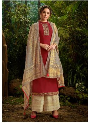
CODE # 24002