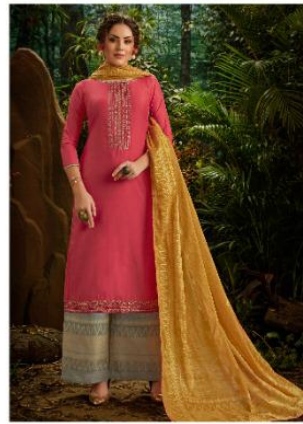
CODE # 24007