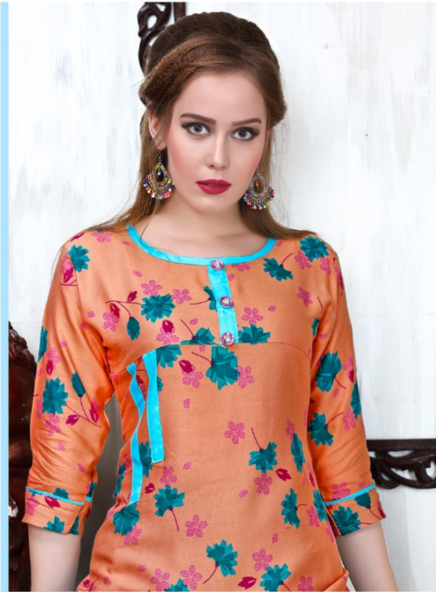
CHARM Majestic shade bright colour is one of the strongest fashion statement of the season and bold desing fashion a more ehereal and exotic elect.