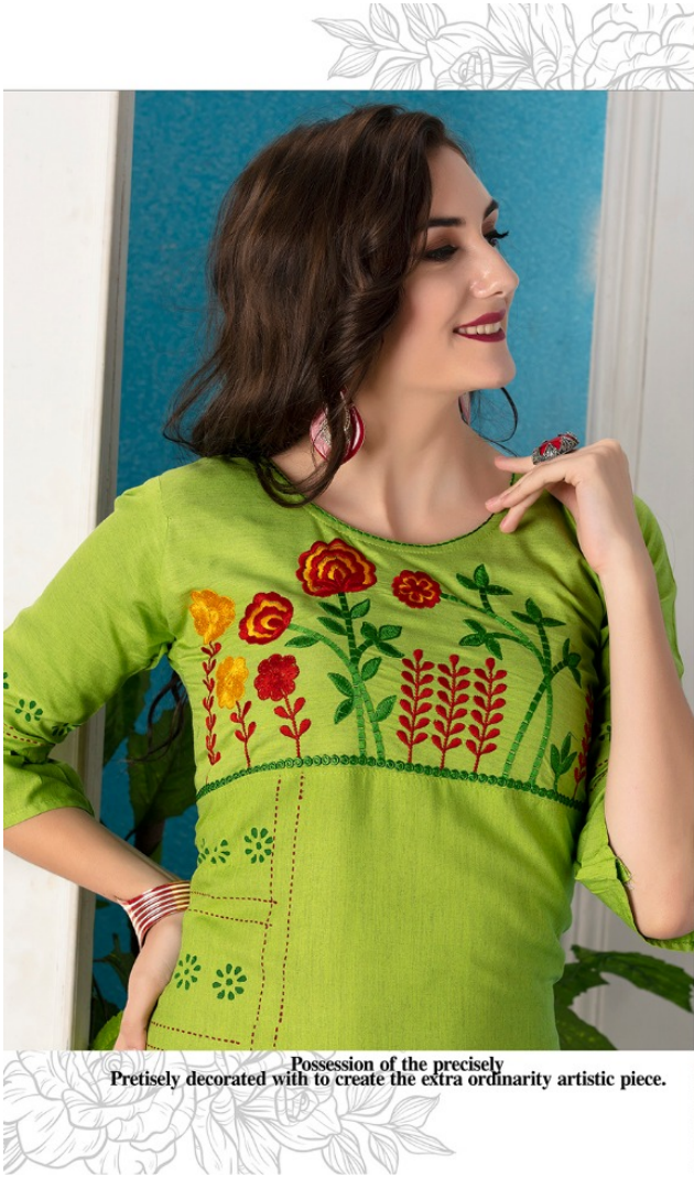
Possession of the precisely Pretisely decorated with to create the extra ordinarity artistic piece.