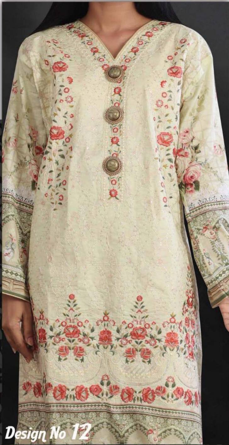
Design No 12