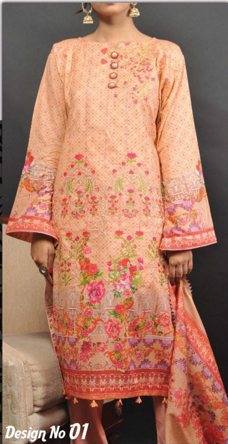
Design No 01