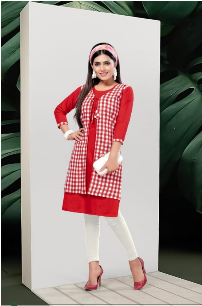
graced by freshness there are certain styles of women apparels that are more popular than the others