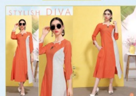
D. No. 1006