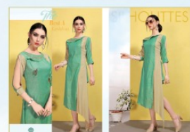
D. No. 1007