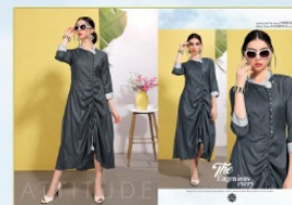
D. No. 1002