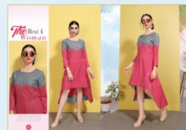
D. No. 1004