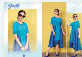
D. No. 1003