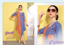
D. No. 1008