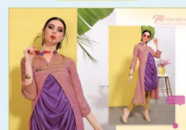
D. No. 1005