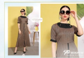
D. No. 1001