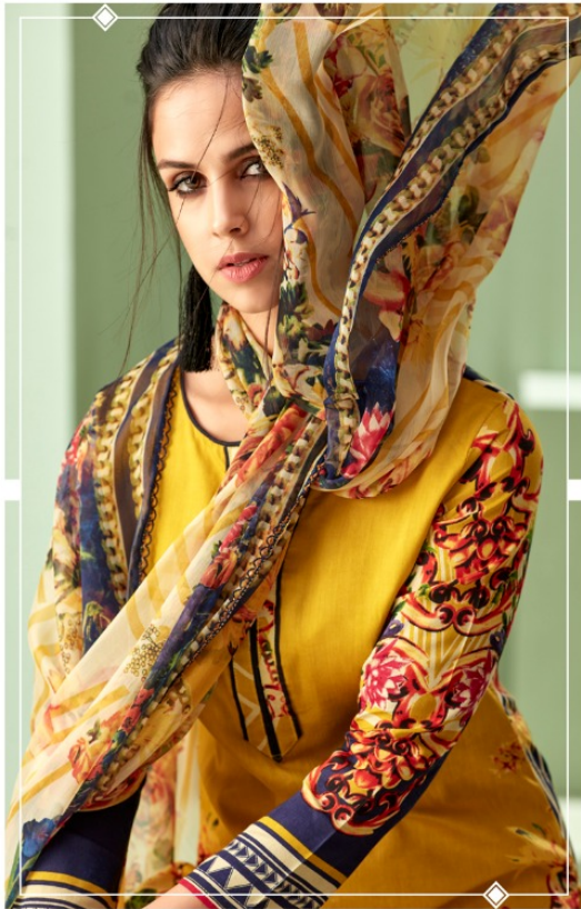
297-001 This season marked with spotless fresh new cuts and stunning texture make personal style