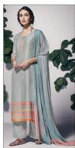
D.NO :- 7334