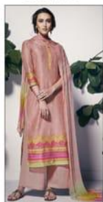
D.NO :- 7331