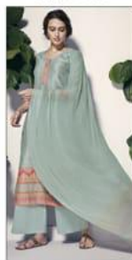
D.NO :- 7332