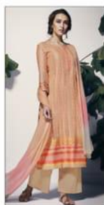
D.NO :- 7335