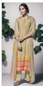
D.NO :- 7336