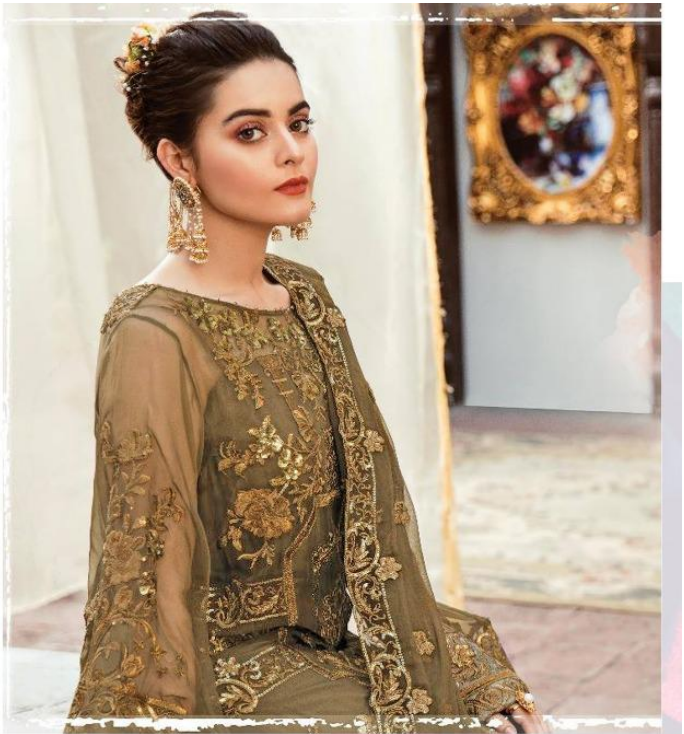
"I like my money right where I can see it...hanging in my closet."