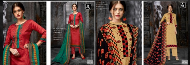
Code # 365 - 009