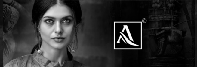
Code # 365 - 004