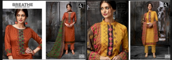
Code # 365 - 007