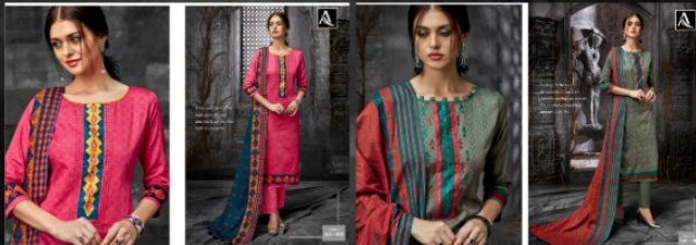
Code # 365 - 005