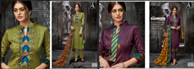
Code # 365 - 001