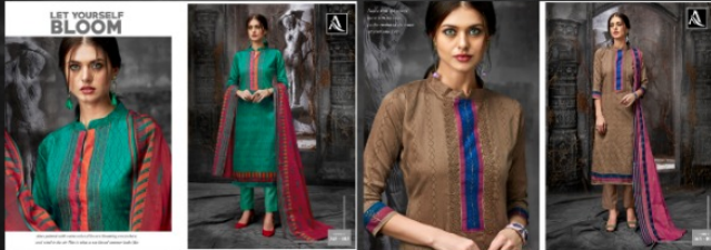
Code # 365 - 003