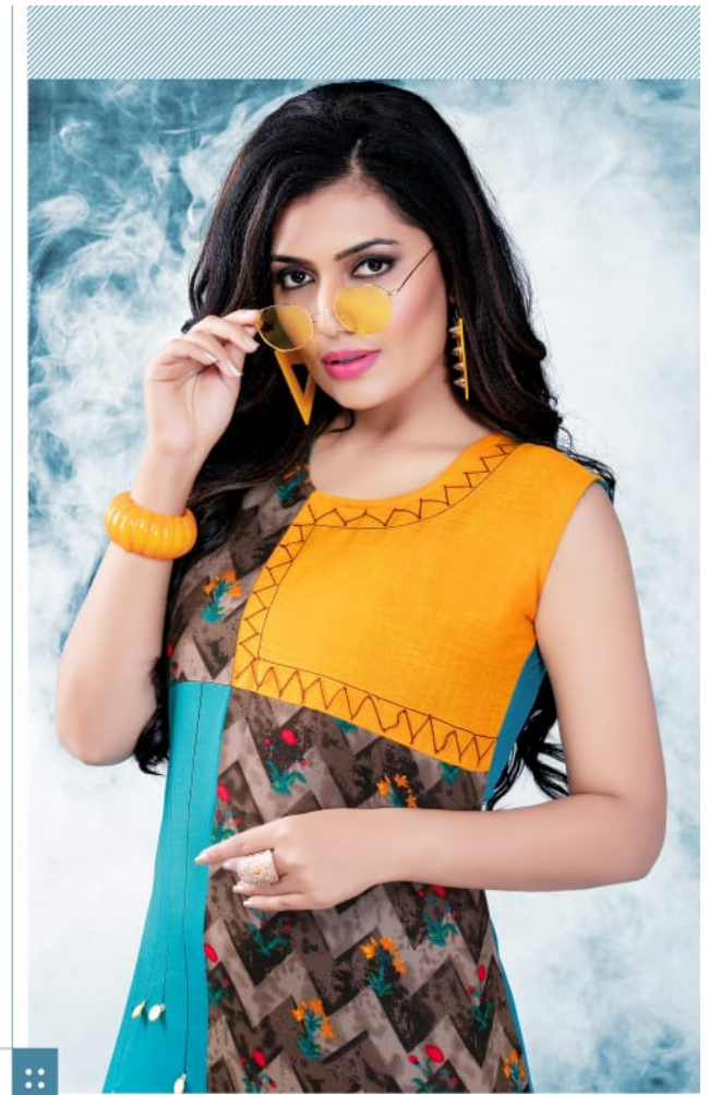
graceful enlightenment with catchiest statement