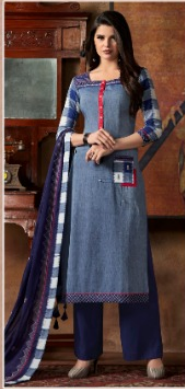
◆ D.No.2195 ◆