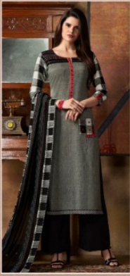
◆ D.No.2191 ◆