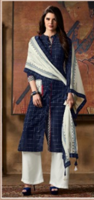
◆ D.No.2192 ◆