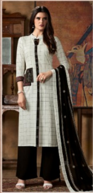
◆ D.No.2194 ◆