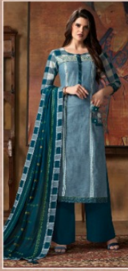
◆ D.No.2193 ◆