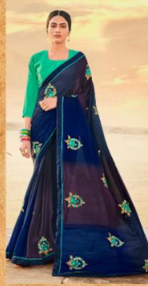
D. NO. - 1002