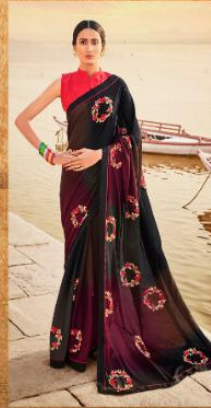
D. NO. - 1004