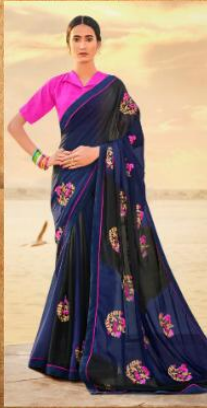
D. NO. - 1003