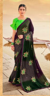
D. NO. - 1006