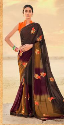
D. NO. - 1005