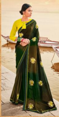
D. NO. - 1001