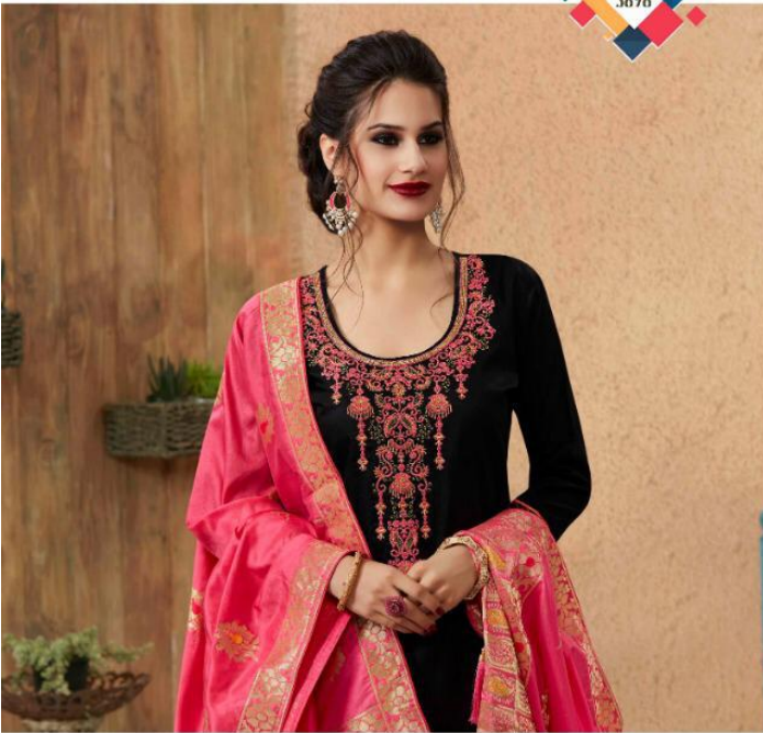
Up your fashion game with grace and style adorning fine designed dresses embellished with delicate work.