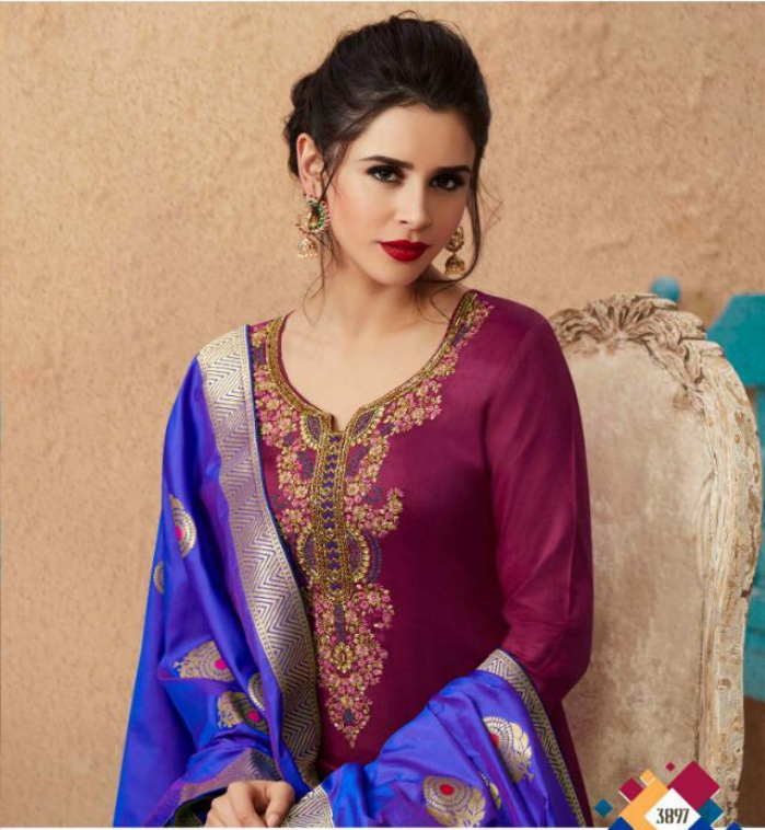
6. As the season of festivities knocks on our doors, get ready with the most amazing festive attires.