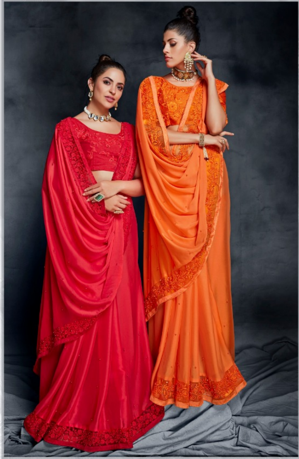
DIFFERENT CULTURES COME TOGETHER IN A TRIBUTE TO FASHION'S BIGGER MOMENT THIS SEASON # 80007#