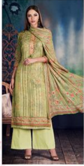
STYLE.NO - 6801