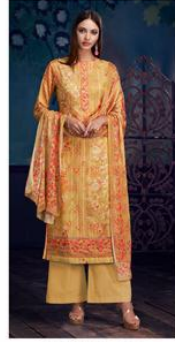
STYLE.NO - 6808