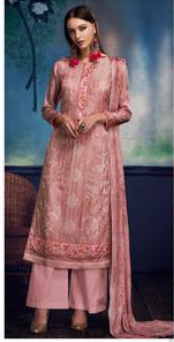
STYLE.NO - 6803