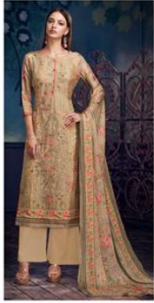
STYLE.NO - 6806