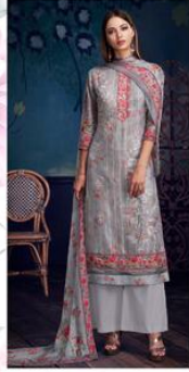
STYLE.NO - 6807