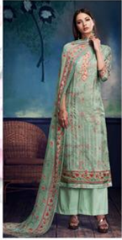
STYLE.NO - 6804