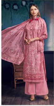
STYLE.NO - 6805