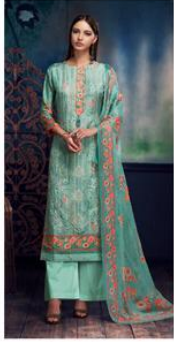
STYLE.NO - 6802