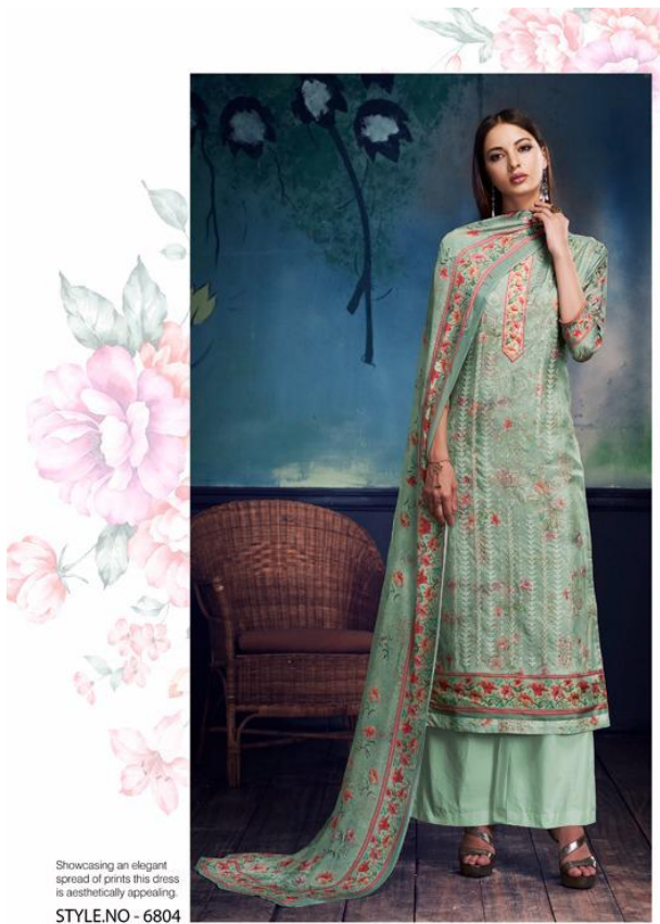
Showcasing an elegant spread of prints this dress is aesthetically appealing. STYLE.NO - 6804