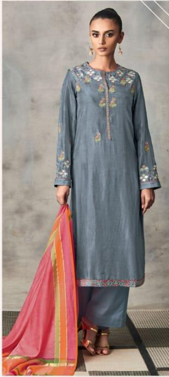
DESIGN NO. 895