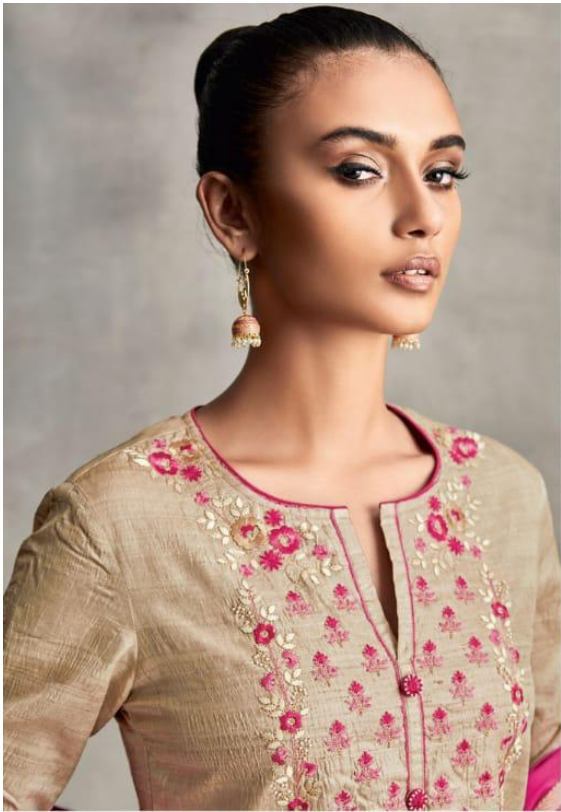
DESIGN NO. 891