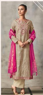
DESIGN NO. 891