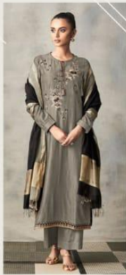
DESIGN NO. 800