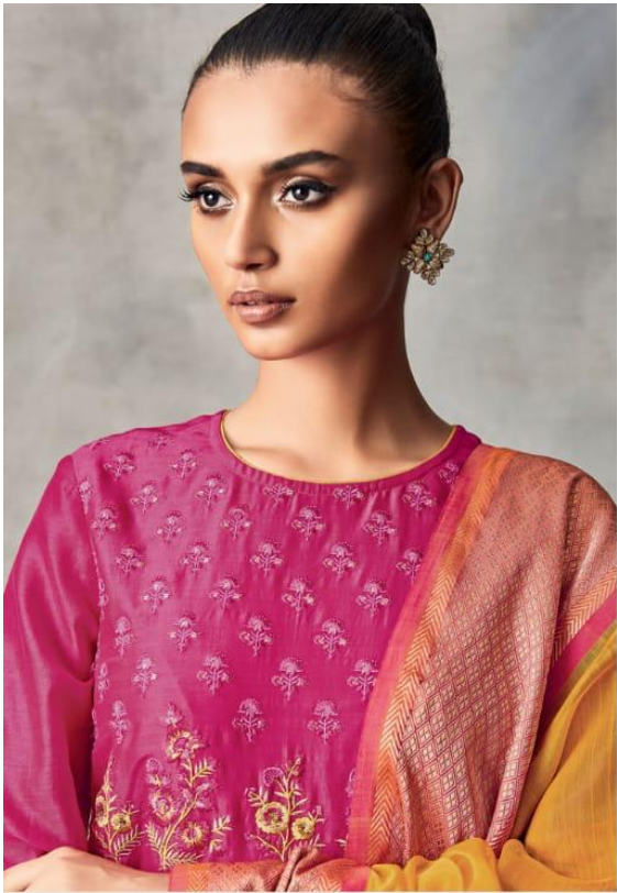
DESIGN NO. 867