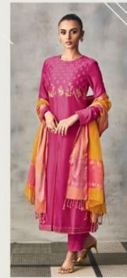
DESIGN NO. 867