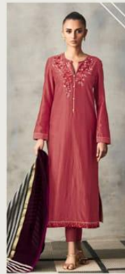
DESIGN NO. 819