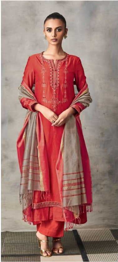
DESIGN NO. 885