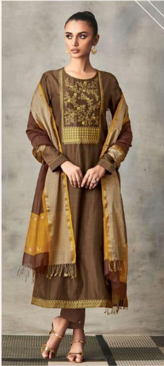
DESIGN NO. 813