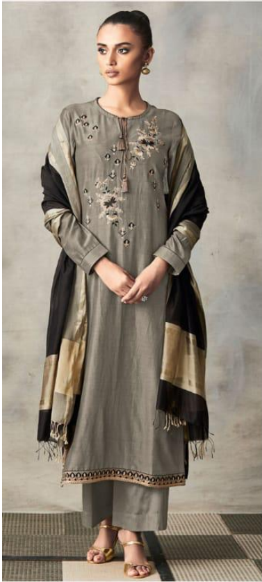
DESIGN NO. 800