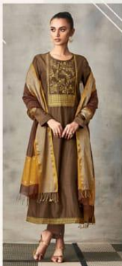
DESIGN NO. 813