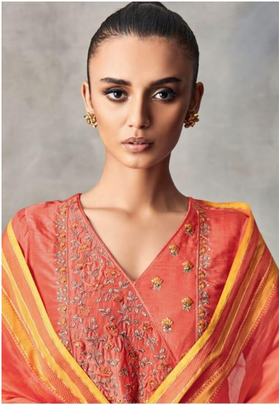
DESIGN NO. 845