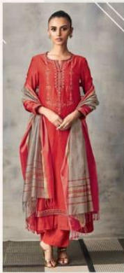
DESIGN NO. 885