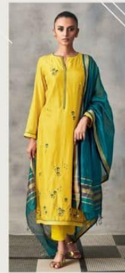
DESIGN NO. 820