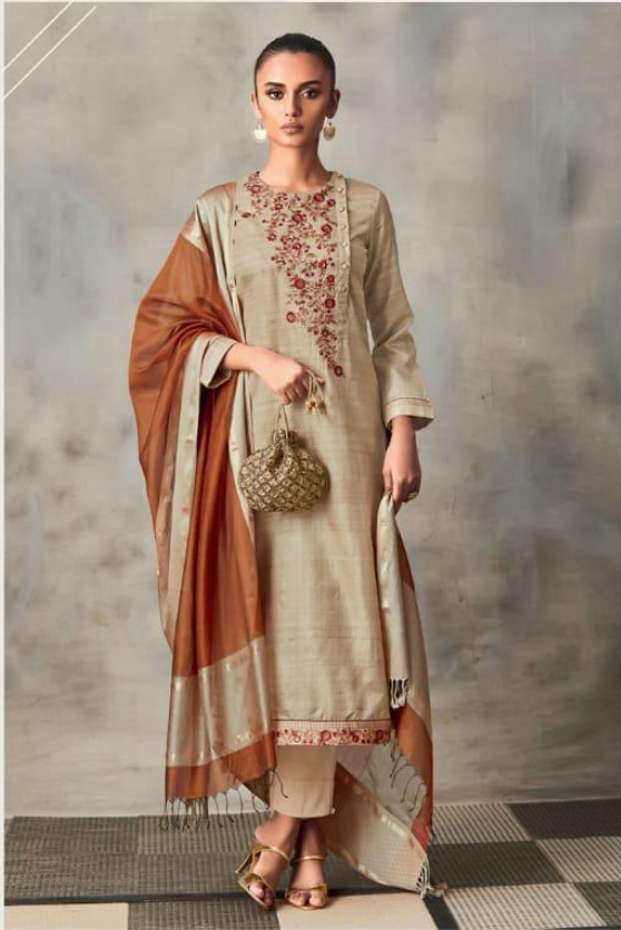
DESIGN NO. 830