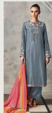
DESIGN NO. 895