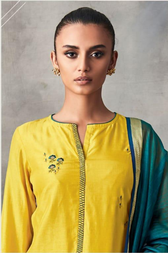
DESIGN NO. 820