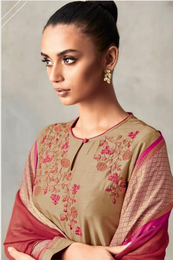
DESIGN NO. 805