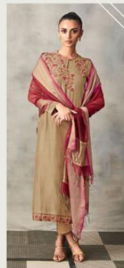
DESIGN NO. 805