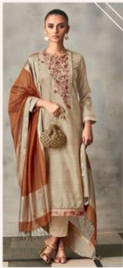
DESIGN NO. 830