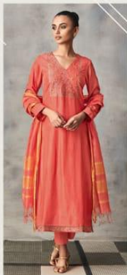
DESIGN NO. 845