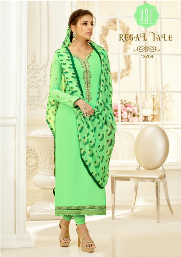
When you love fashion, there is no weekend. Everything just blends together. Fashion is about how you place the object on the person.