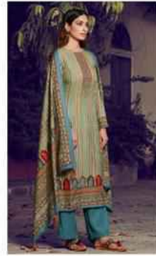
D.NO :- 1007