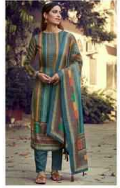
D.NO :- 1004