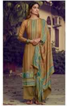
D.NO :- 1008