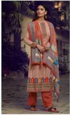
D.NO :- 1005