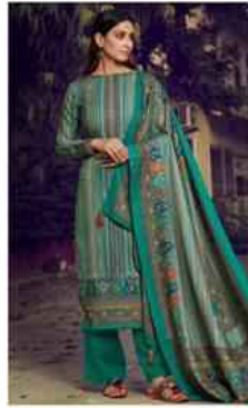
D.NO :- 1006