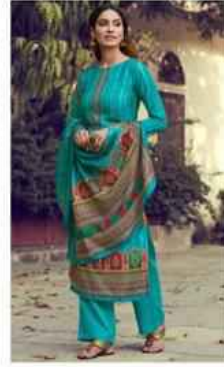
D.NO :- 1003