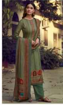
D.NO :- 1002