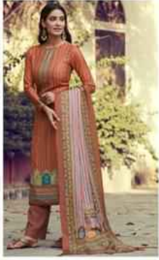
D.NO :- 1001