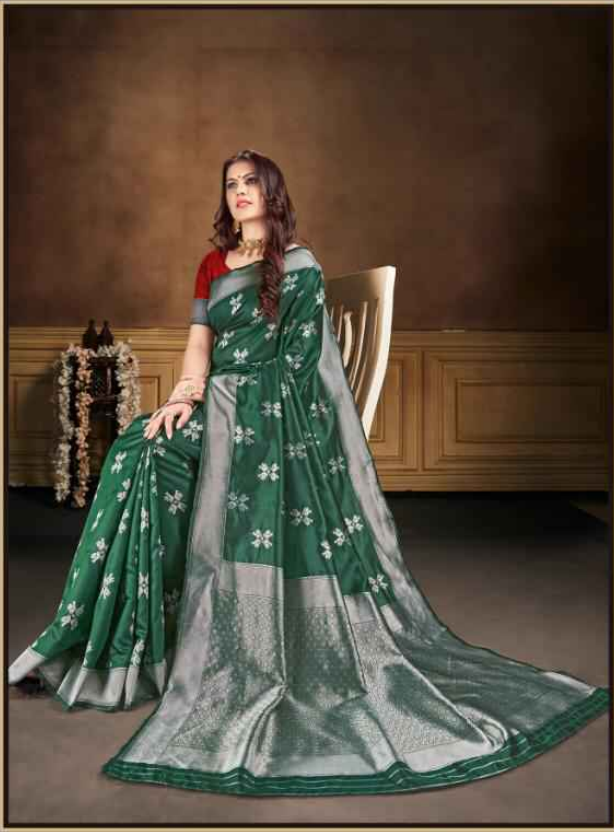
Traditional yet contemporary saree is designed with beautiful patterns.