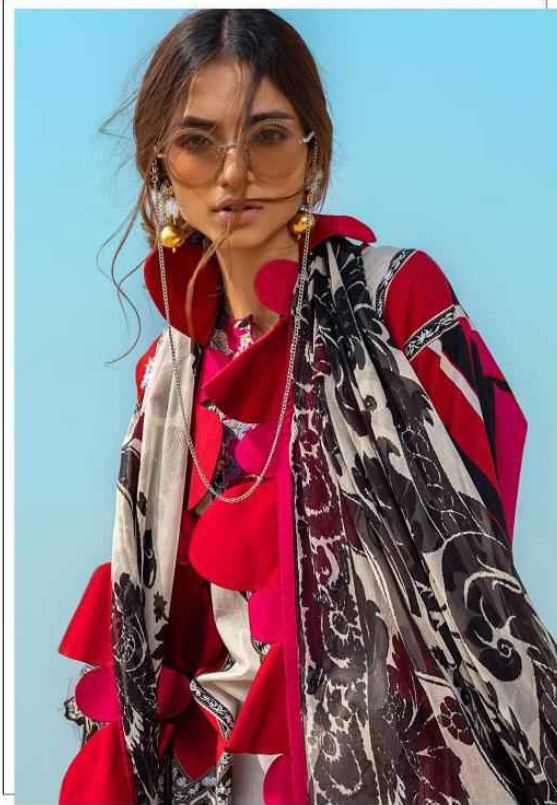
Style is a way to say who you are without having to speak