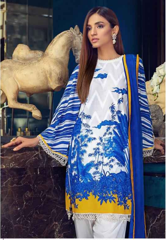
Clothes women nothing until someone lives in them